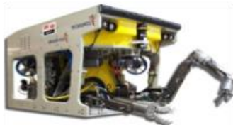
FIGURE 1. Typical ROV

Today the ROVs are often custom made, making them especially applicable to specific tasks and situations. Some design elements are common, such as umbilical cables, multiple cameras, and one or two robotic arms [1]. Additionally, the frame contains thrusters to enable the ROV to move. However, vehicles designed for a specific task are often susceptible to rapid changes in their environment such as forces that alter that designed trajectory.